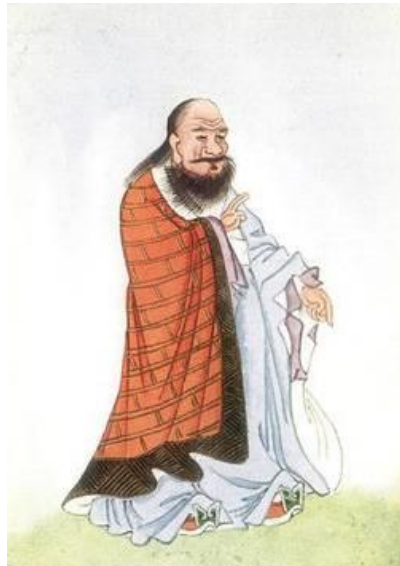
Lao Tzu (604 BC - 531 BC)

If you do not change direction, you may end up where you are heading.